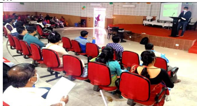
District Level Multi Stakeholder Orientation Workshop, Khowai District on 19-12-2020