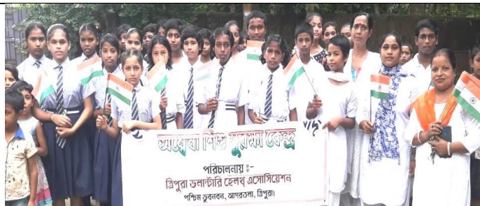
Celebration of Independence Day