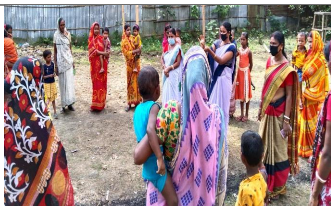
Demonstration of hand washing by a member of CBO