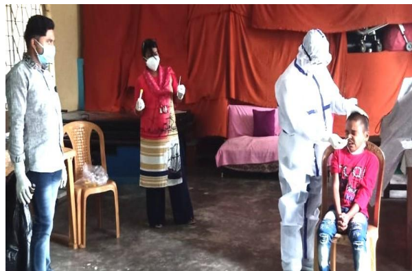
RTPCR Test for COVID 19 on 10th September 2020