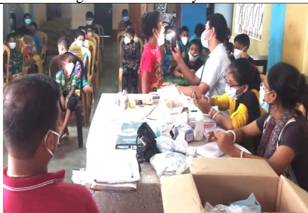
Health checkup of children in Unmesh Home on 13 June,2020

This year, 18 children were exited from Unmesh Home: one child went to Foster Parents, one to After Care Home and 16 children were reintegrated to the families or extended families after the social investigation of the family situation and counseling of both children and family members.