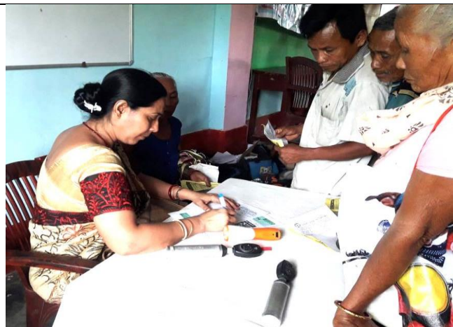
In a rural Eye Camp of VHAT Eye Hospital

“The ultimate measure of a man is not where he stands in moments of comfort and convenience, but where he stands at times of challenge and controversy.”