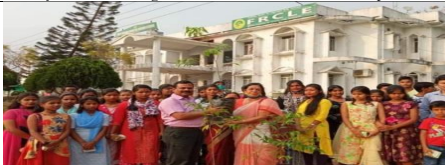
During observation of World Forestry Day 2021

☛ World Forestry Day 2021: This was observed with the Forest Research Centre and Livelihood Extension of 21 st March 2021. The theme of this day for 2021 was "Forest restoration: a path to recovery and well-being". 40 children of Anwesha Home participated in it.