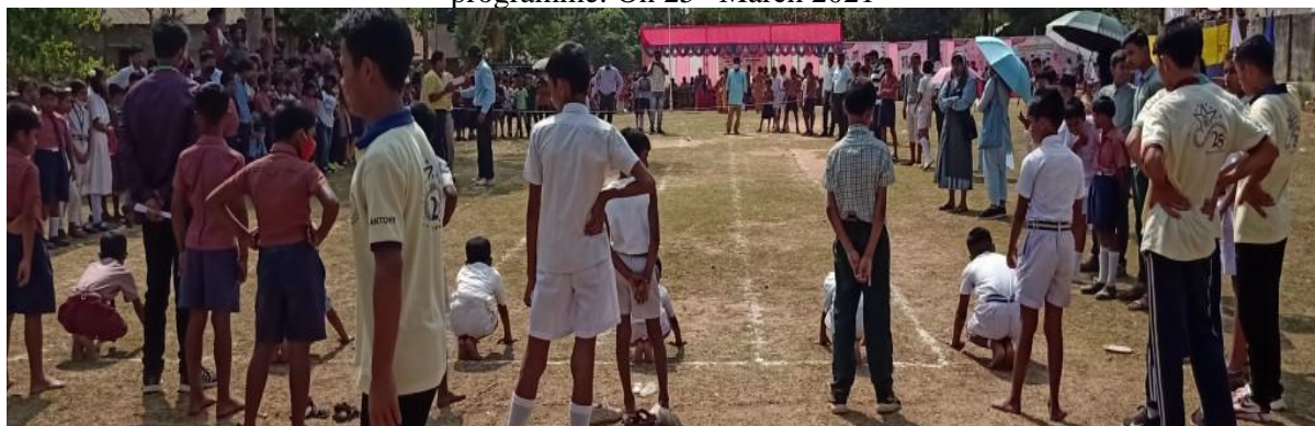
Children during the Inclusive Indigenous Sports and cultural programme: On 25 th March 2021