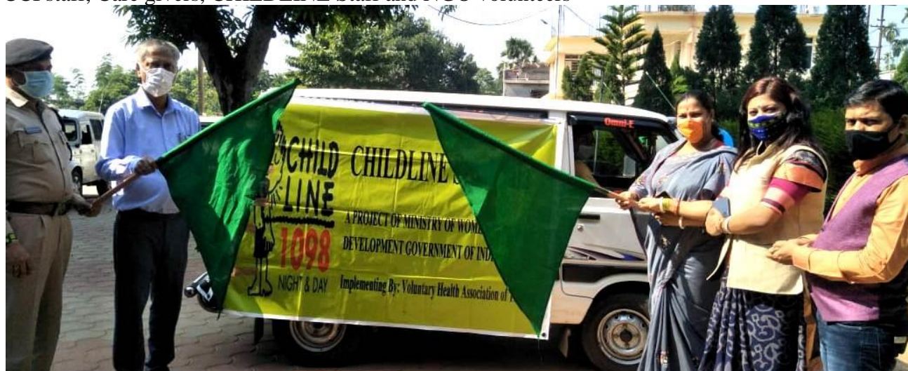
Mass awareness program on Child rights and CHILDLINE through mobile van

→ MHPSS Services:- Sepahijala CHILDLINE organized the Awareness program on Mental Health & Psychological support service for three months from January,2021 to March,21 with DCPO staff, CCI staff, Care givers, CHILDLINE Staff and NGO volunteers