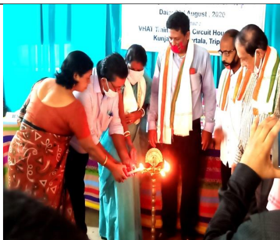
Inauguration of 32 nd Annual General Meeting of VHAT