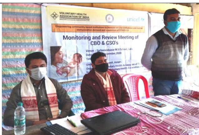
Monitoring & Review Meeting in November 2020 in Hilakandi