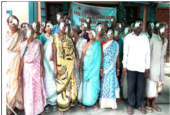
Eye patients after the surgery in VHAT Eye Hospital