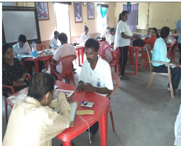
Student during practical examination (viva) on 9 th January 2021