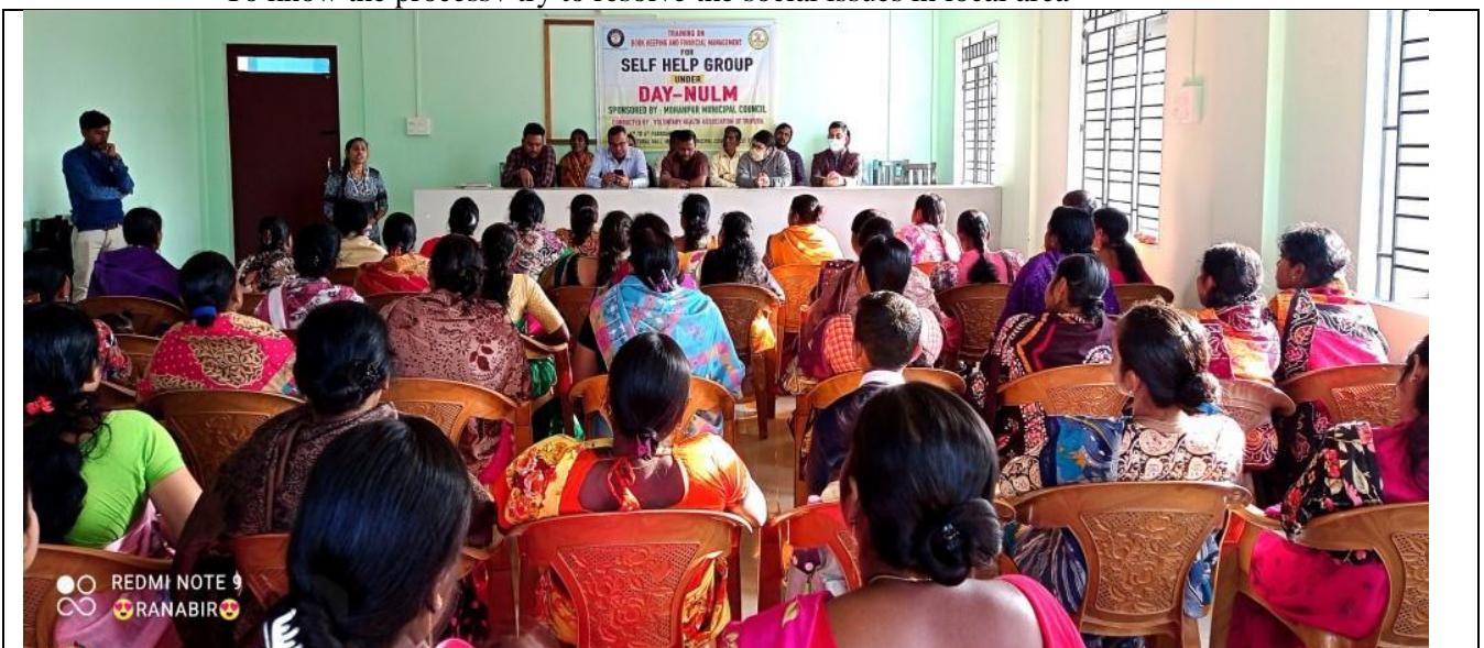
Book Keeping & Financial Management Training for Members of Women Self Help Groups under NULM