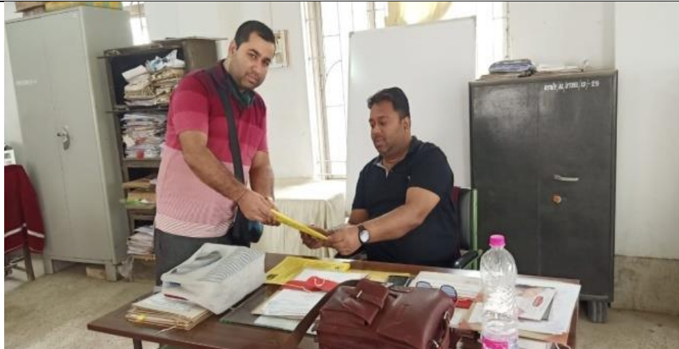
Distribution of leaflets under “Badhte kadam” to the Deputy Commissioner of Disability, Govt. of Tripura

Again, from 25 th February to 6 th March, 2021, we organized “BADHTE KADAM” for communities in West Tripura District, regarding the schemes of National Trust for the welfare of PWDs (autism, mental retardation, cerebral palsy and multiple disability ) by printing and distribution of Leaflets. VHAT also arranged Small focus group discussion by maintaining social distance. Communication with parents and other stakeholders for providing facilities to the PWDs under National Trust Act, 1999.