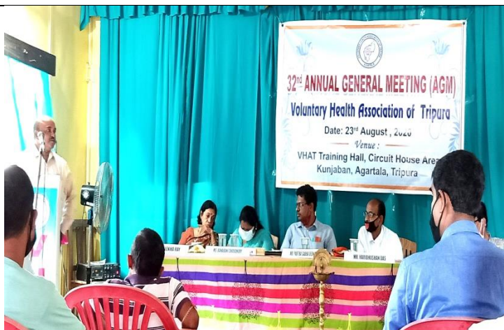
32 nd Annual General Meeting of VHAT