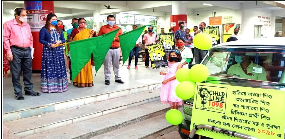
Inauguration of CSD Van in presence of Respected Dignitaries