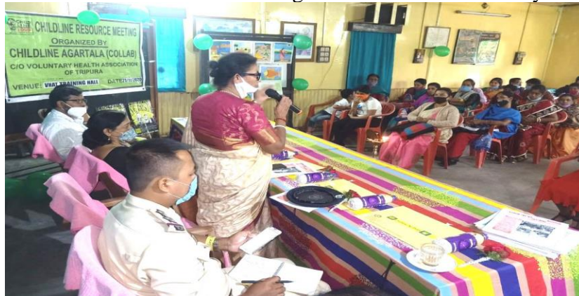
Resource Organizations Meeting on 21st November 2020