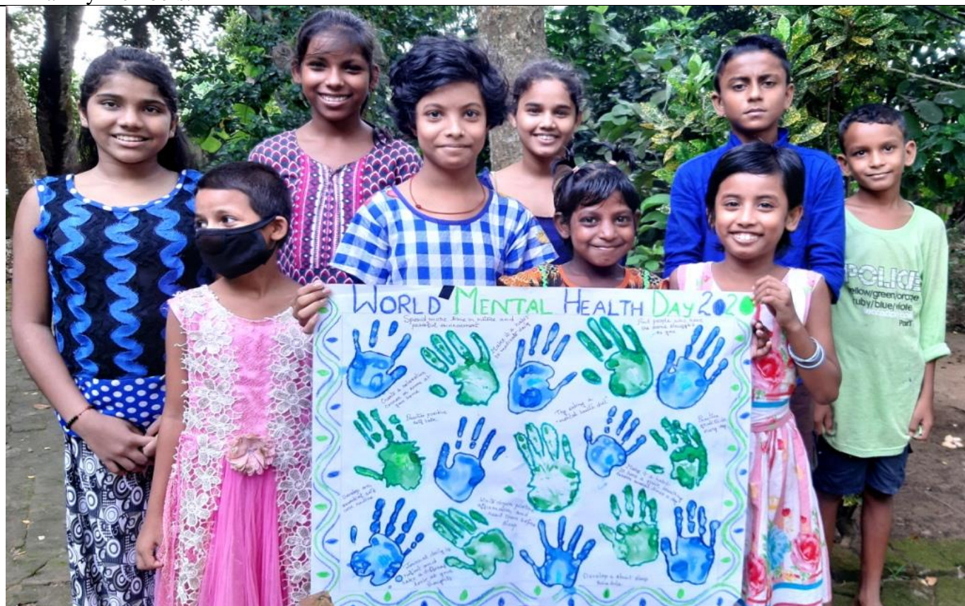
"Importance of good mental health tips during covid-19 Situation" was made by kids

This year, with permission of CWC, 16 children were reintegrated to the families or extended families after the social investigation of the family situation and counseling of both children and family members.