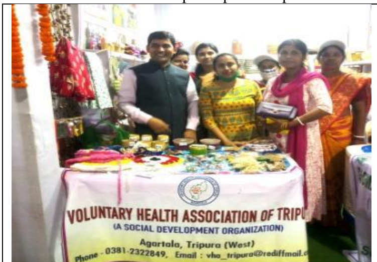
SHGs participated in Saras Fair 2021