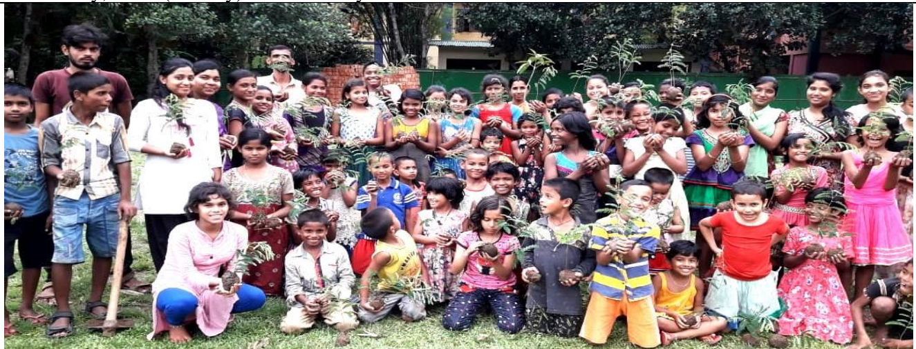
Children of Anwesha Home on World Environment Day