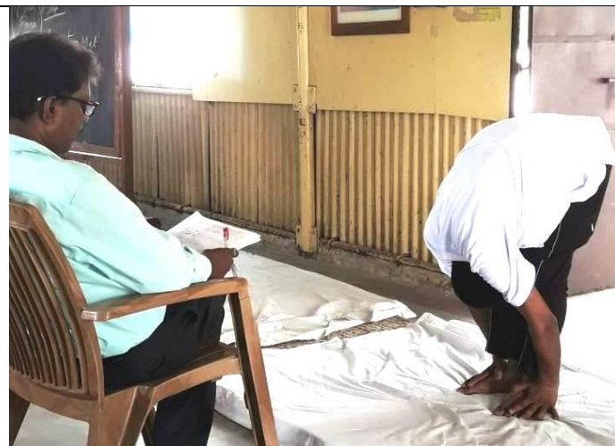
Practical demonstration during the examination on 9 th January 2021