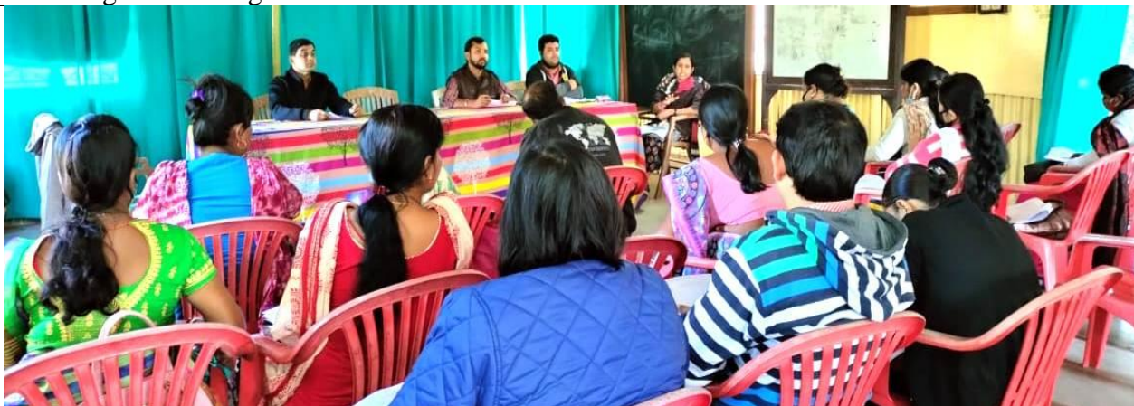
Review meeting of Animators of E-Shakti project