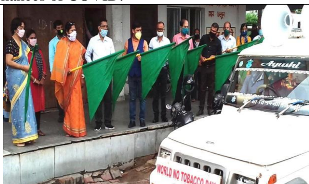
Flag off by MP on World No Tobacco Day

Observation of World No Tobacco day 2020: This day was observed on 31 st May, 2020 in four districts i.e. West Tripura, Khowai, Gomati and South Tripura. The theme of this year was 'Protecting youth from industry manipulation and preventing them from tobacco and nicotine Use'. An awareness on wheel and community advocacy meeting was conducted at various places of all four districts. The flag off was done by Ms. Pratima Bhowmik, Hon'ble Member of Parliament, West Tripura. The objective of the on wheel awareness were - to aware the tobacco related issues, COTPA law and the dangerous diseases due to the consumption of tobacco products. The District Coordinator and Project Manager conducted miking to aware the people not to smoke in public places and also not to spit in public after chewing the smokeless tobacco as it increases to spread the chances of COVID.