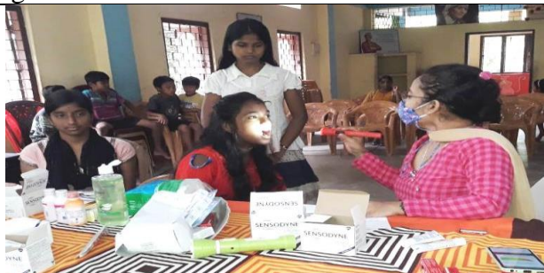
Dental checkup in Anweshha Home

Apart from providing emergency care and protection, the Open Shelters were linked with a specialized adoption agency, through which the home can give the children for adoption who were registered under CARA.