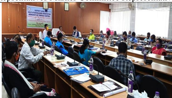
District Level Multi Stakeholder Workshop, West Tripura, on 23-10-2020

In person meeting with Various Stakeholders: In persons meeting was held with the various gov. officials and other stakeholders i.e. Health & Family welfare department, District Administration, Rural Development Department, Police Department, Social Welfare Department, Education Department, Labour Department, PRI Members, Civil Society organizations, Motor Unions Representatives Marker Committee Representatives etc