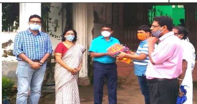
Donation of dresses by VHAT for psychiatric patients of Modern Psychiatric Hospital