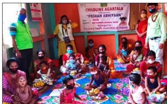
Poshan Abhiyan in West Chanmari ICDS Centre.