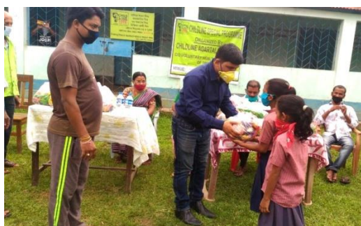
Distribution of dry ration ,masks & sanitizers