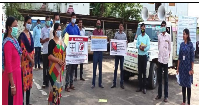
Advocacy with Government Officials on World No Tobacco Day 2020

Mapping and Listing of Stakeholders: As per the work plan the mapping of various stakeholders has completed. The status of mapping and listing : Government officials - 508 no's, NGOs - 89 no's, Educational Institution - 338 no's, Public places - 286 no's and Tobacco Vendors/Traders – 229 no's. The activity will continue in future also.