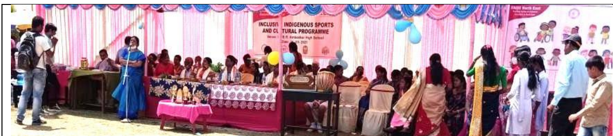
Executive Director of VHAT during her speech in Inclusive Indigenous Sports and cultural programme: On 25 th March 2021