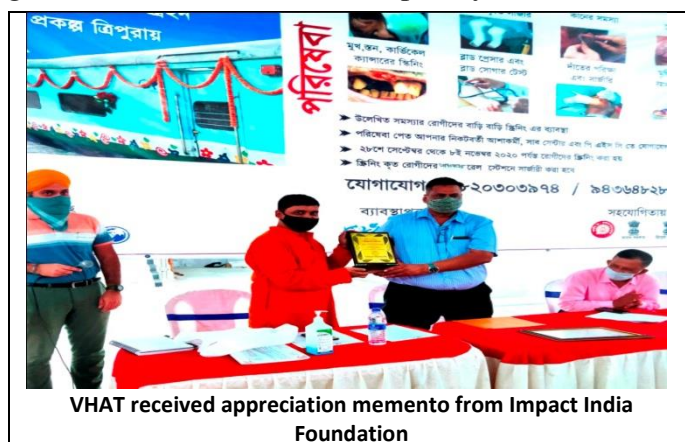
VHAT received appreciation memento from Impact India Foundation

☛ Outreach Activity of Lifeline Express by VHAT: Impact India Foundation's Lifeline Express in partnership with the Indian Railways, has provided medical care to more than 10,00,000 poor people in rural India, restoring sight, movement, hearing and correction of cleft lips with dental and neurological treatment and more, completely free of cost. VHAT has partnered with Impact India Foundation for implementation of outreach activities of Lifeline express in Dhalai and South Tripura District. The outreach activities were awareness creation, door to door visit, patient screening, mobilize the patient for the treatment, follow up, support patients to attend the doctors during the camp at Railway Station. Total 6914 households were visited by VHAT volunteers by door to door survey and covered 11 (eleven) healthcare establishments of South Tripura and Dhalai. Patients identified as Eye/Cataract 1978, Ear/Hearing 543, Dental issue 526, Cleft lip 9, Epilepsy 19, Gynecological issue 79 and other 228.